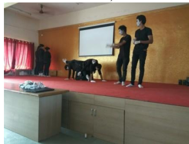
Students Performing Mime Act