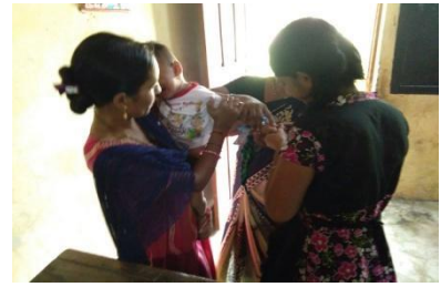
Volunteers marking the vaccinated child