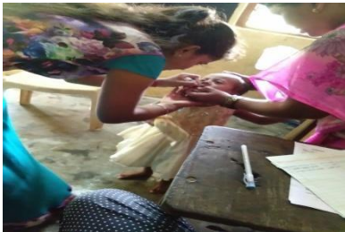
Volunteers giving vaccines