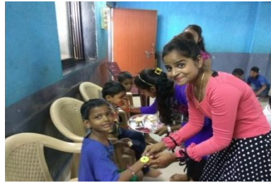
Celebrations at satkarm Ahram Badlapur