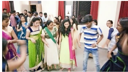
Teaching staff playing Garba