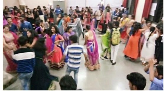
Students Playing Garba