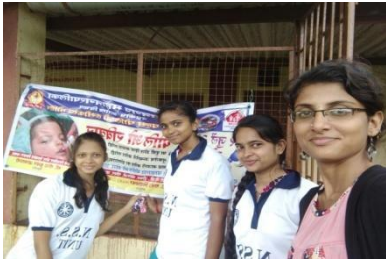
Volunteers with banner of Polio Immunization programme