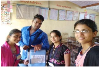
Volunteers carrying the vaccine box