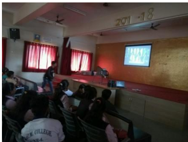
Students Watching the Short Film on AIDS Awareness