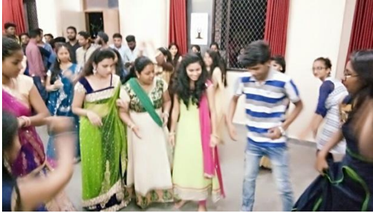
Students Playing Garba