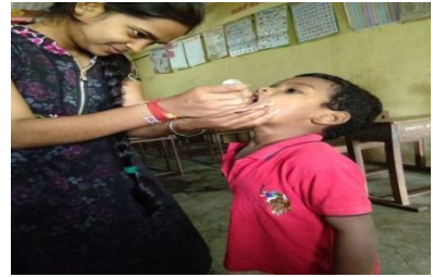
Volunteers giving vaccines