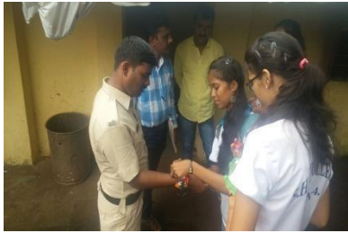
Volunteers celebrating rakshabandhan with police officers