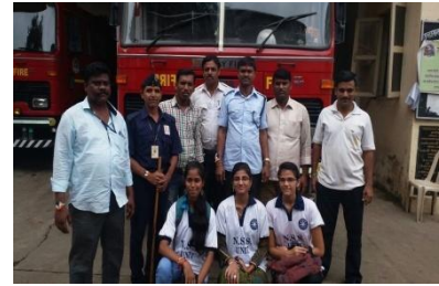
Volunteers celebrating rakshabandhan with Fire Brigade officers