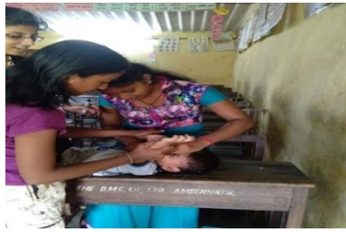
Volunteers giving vaccines