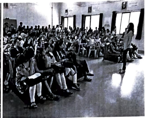
Students attending the lecture