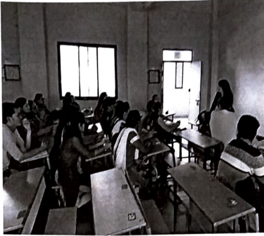
Career Guidance Seminar