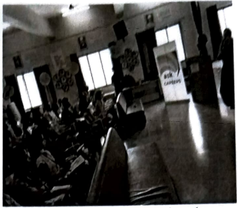
Principal Mam addressing the students.