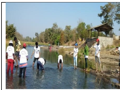
Constructing stone check dam

NSS Special Camp was indeed a special one for all the volunteers as the bond between the villagers and volunteers has extended now over three years. 61 NSS volunteers attended the camp at the Pimpalpada Tute, at. Post Kharivali, Shahpur which is their adopted village from 6 th Jan, 2019 to 12 th Jan, 2019. The volunteers came with the intent of making their two projects i.e. Youth for cleanliness and health and hygiene successful in this Village and to the extent the students were successful enough to do so.