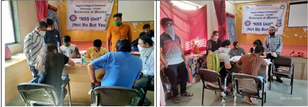
Voters Registration Drive

Opposite Bank of Baroda, Ulhasnagar-421 004