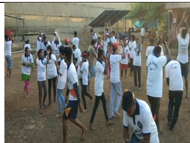
Street Play Lecture