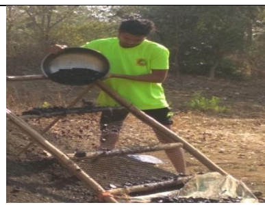
Volunteer extracting sand