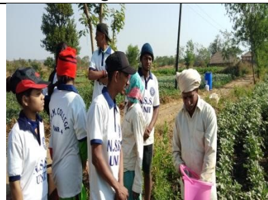
Volunteers learning agricultur