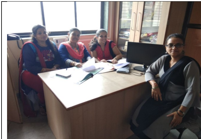
Library Committee Team

ATTACHMENTS: Criteria chart and candidate/referee transcripts